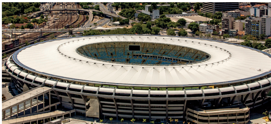
Maracanã Stadium, Brazil

Disneyland, worldwide • Oceanário Aquarium, Portugal • Regency Casino Thessaloniki, Greece • City of Dreams, China* • Legoland California, USA