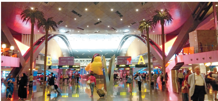
Hamad International Airport, Qatar